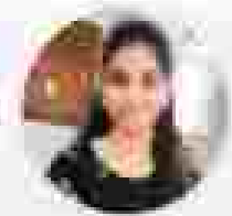
Mithunassi B Enterprise Security Analyst