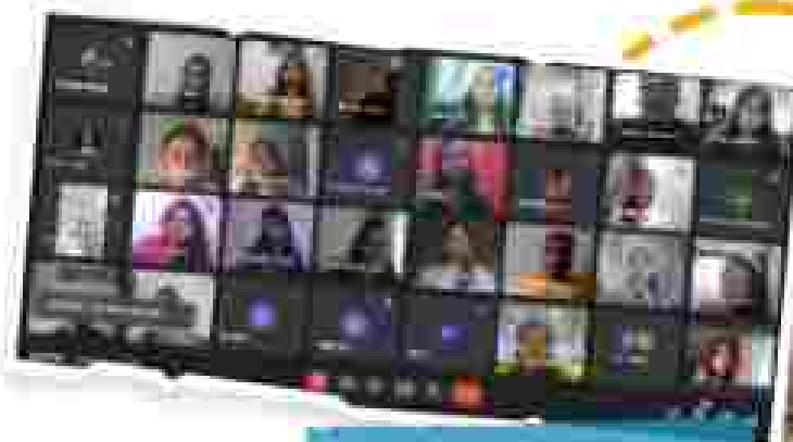
Women's day Celebration